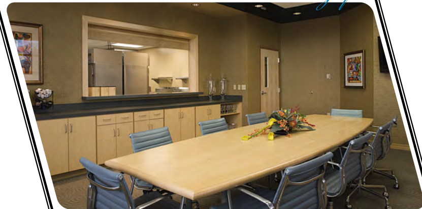
Darios Private Dining Room & Executive Conference Room