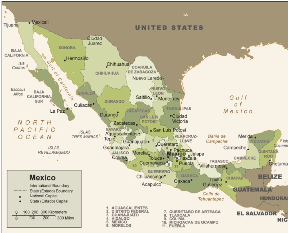
Figure 1. Map of Mexico